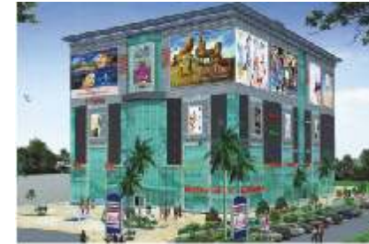
The Celebration Mall, Amritsar.