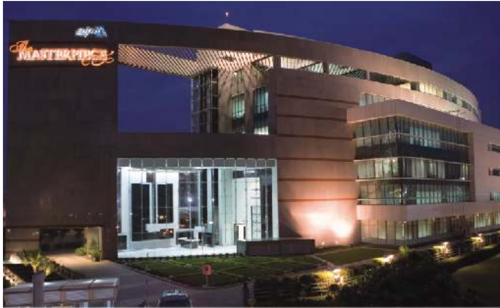
The Masterpiece, Gurgaon