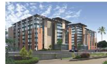
Ecospace, New Town, Kolkata