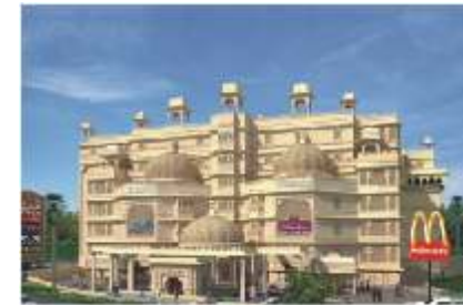
The Celebration Mall, Udaipur.

Let's advance India..... We are doing it.